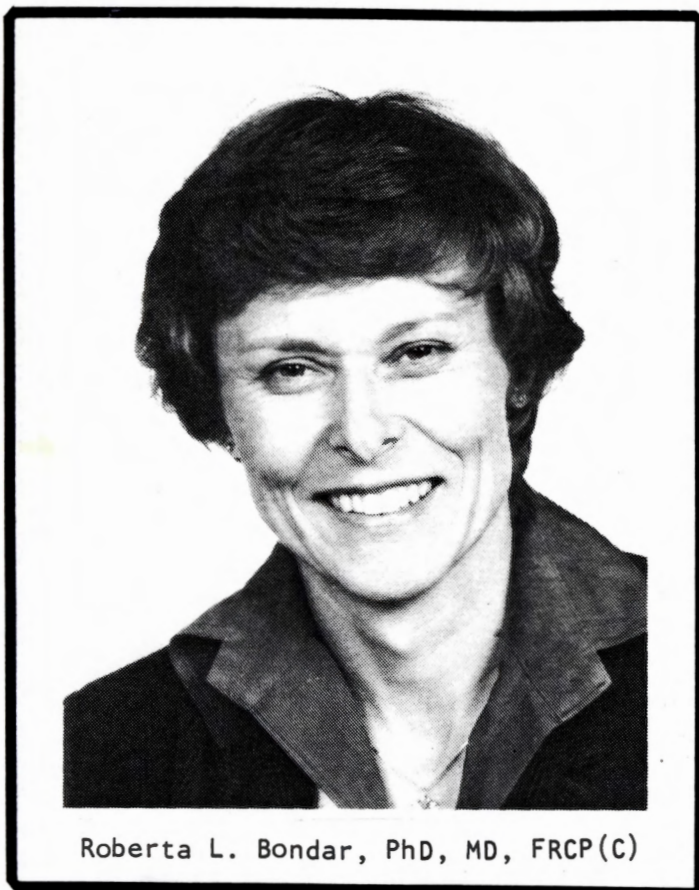
Roberta L. Bondar, PhD, MD, FRCP(C)