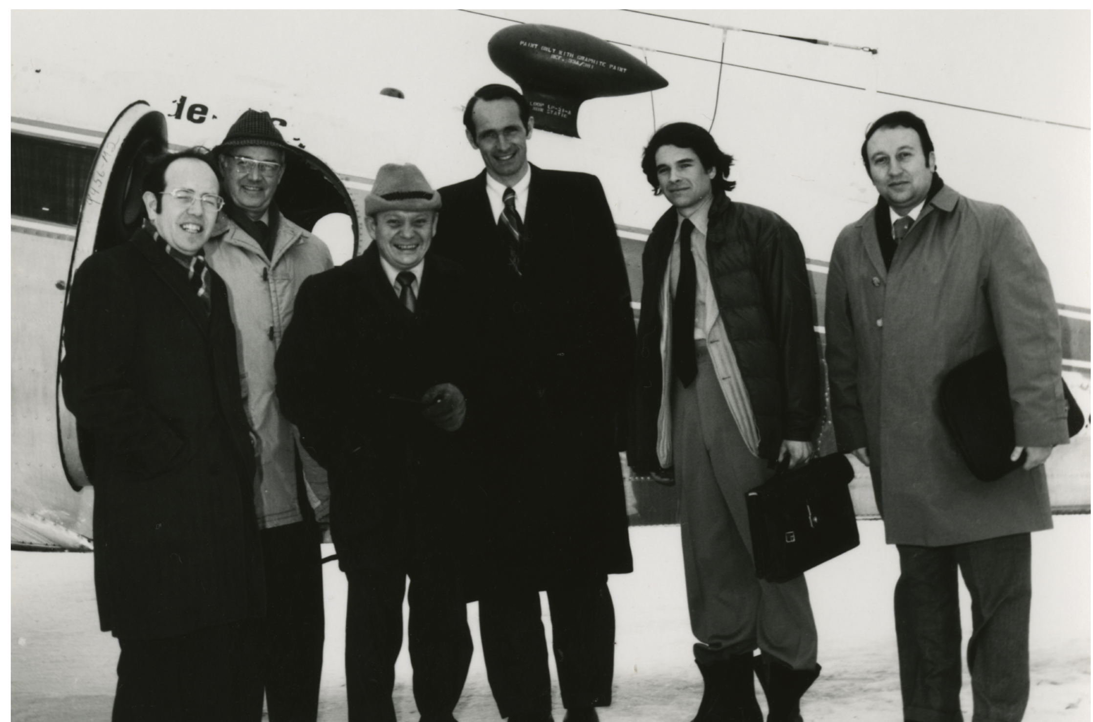
McMaster team visits northern Ontario, February 4, 1972.

Development of the Northern Ontario Medical Program begins.