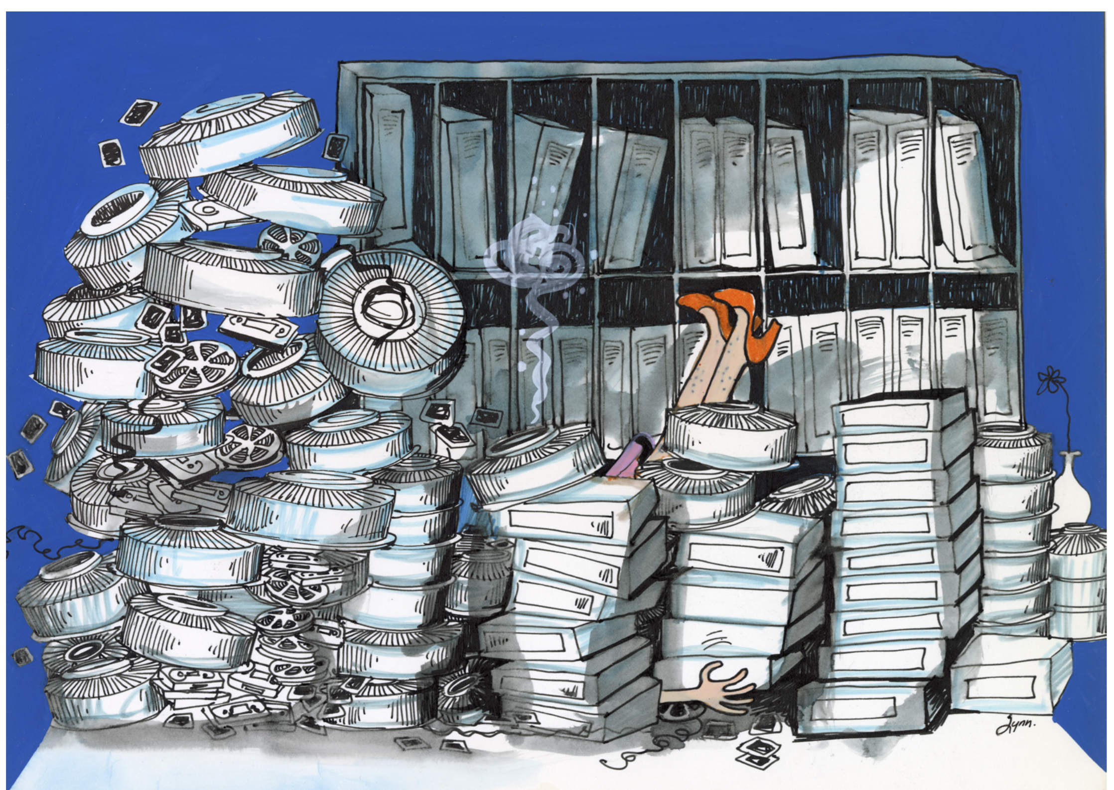
Lynn's depiction of the school's storage and rapid retrieval system, around 1970.

Lynn Johnston was one of the school's three original medical artists. Later, she begins drawing her iconic For Better or For Worse comic strip.