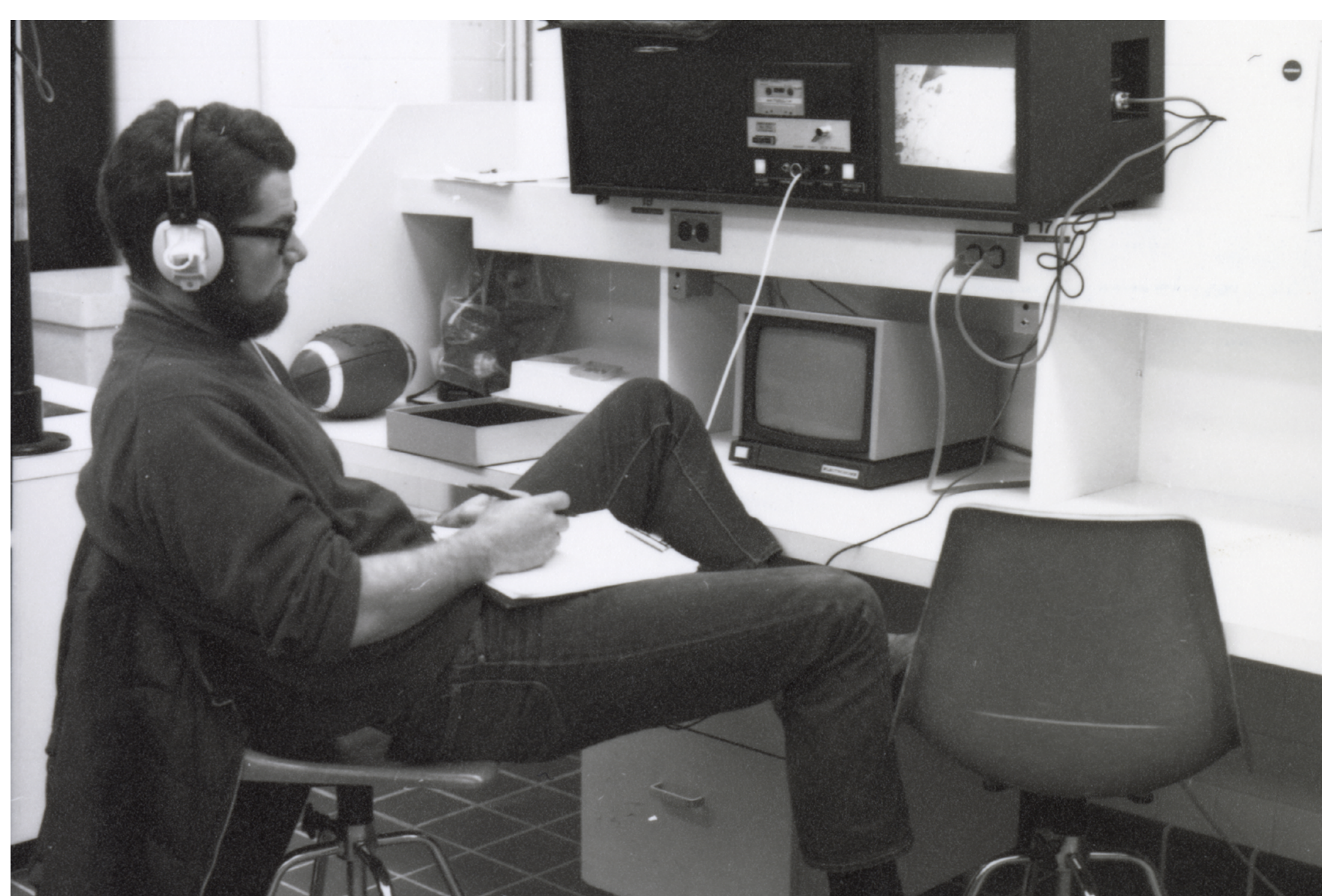
A student from the first class studies in the school's temporary facility in Chedoke's laundry building, 1969.

Semester begins for the first class of 20 students.