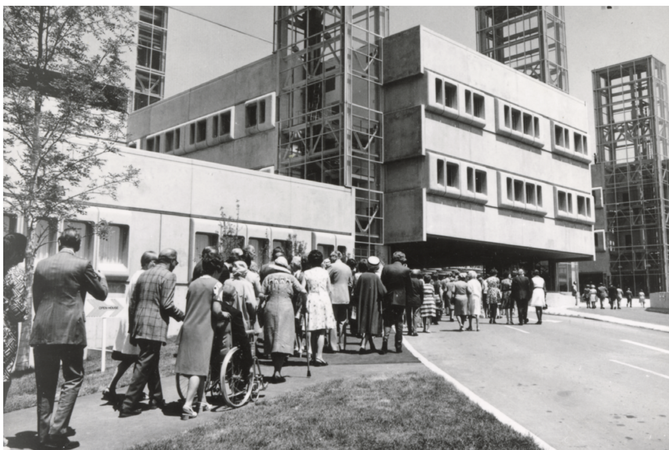
Crowds enter HSC on its opening day.

Health Sciences Centre (HSC) opens (AKA McMaster University Medical Centre) following years of local controversy over its location.