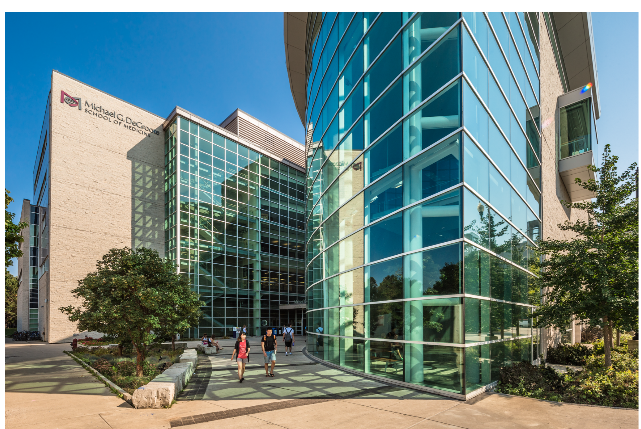
Exterior of MDCL, around 2013.

The Michael G. DeGroote Centre for Learning and Discovery (MDCL) opens.